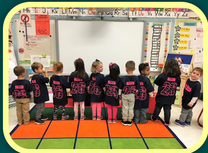
And then from the back.....