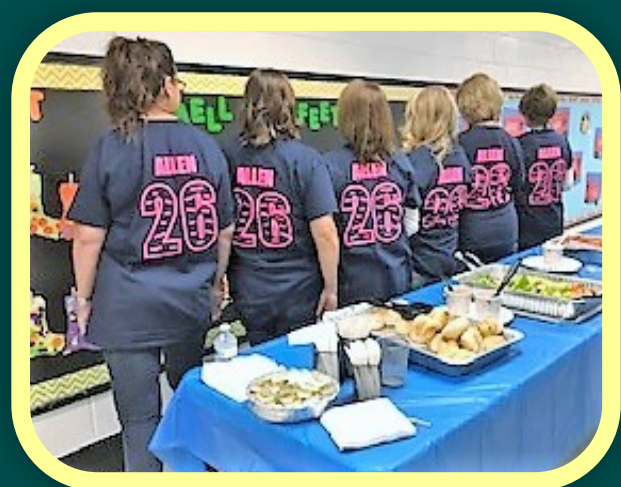
And then from the back, too!