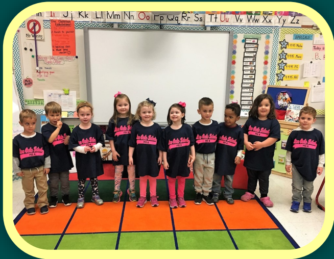
Live Oaks Students at the Family Dinner