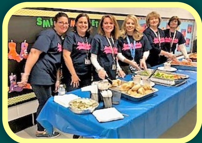
Here is the staff serving the children and parents!