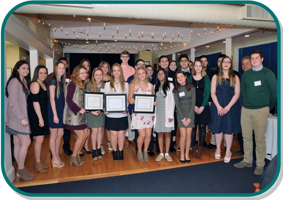
The Milford Salvation Army Service recognized the efforts of students from the Jonathan Law, Joseph A. Foran and Platt Technical High Schools who collected over $8,000 in donations while standing outside local Milford stores from Thanksgiving to Christmas by presenting them with Certificates of Appreciation. Pictured below: Representatives from the Hartford office of the Salvation Army and members of the Milford Salvation Army were present to acknowledge and thank the students for their efforts to support Milford families.