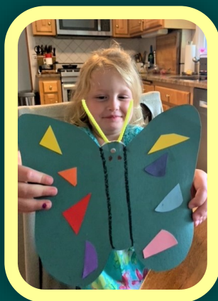
and then to a beautiful butterfly!