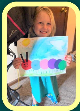
to a colorful caterpillar