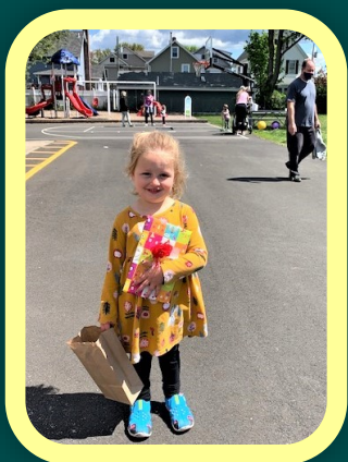
From the take home makings