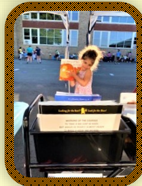
A good book to cuddle up with