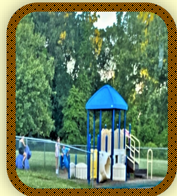
Staying in touch with their inner child