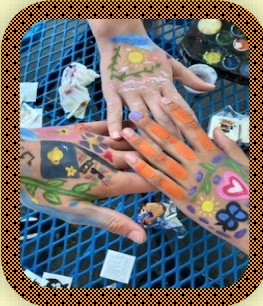
Our volunteers lending a helping hand