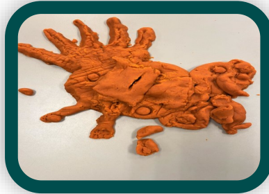
Hello Mr. Turkey