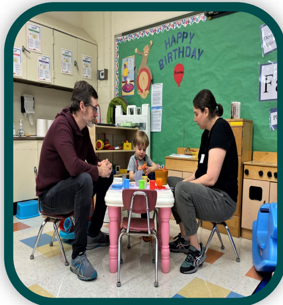
Tea Time with Mom and Dad